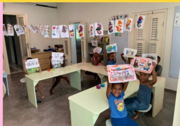
• Craft & Fun 'underwater life'