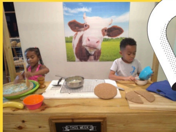
Fun at Children Museum Curacao